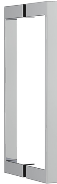
Double Door Handle shown with no Rosette